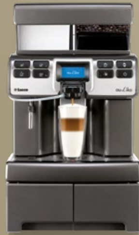
Aulika Top / Top RI High Speed Cappuccino