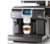
Royal Gran Crema

*Supplied separately; installed by the operator