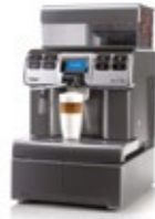
Aulika Top / Top RI High Speed Cappuccino