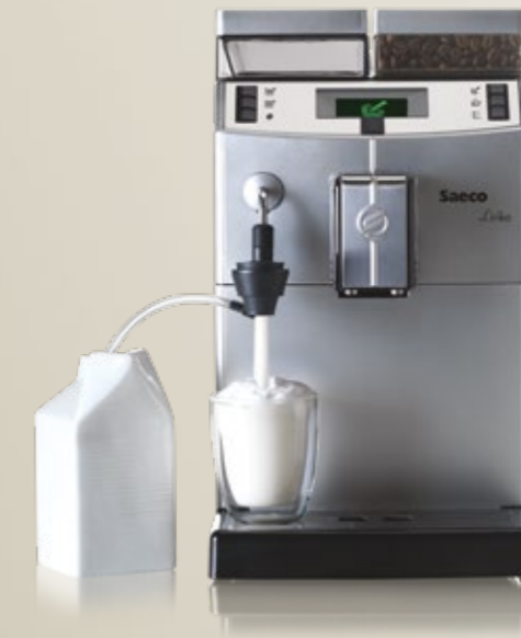
Lirika Tuono Cappuccinatore

Tuono cappuccinatore to be mounted on the steam wand for the frothing of creamy cappuccinos and milk drinks. It can be used also in combination with the Milk Cooler.