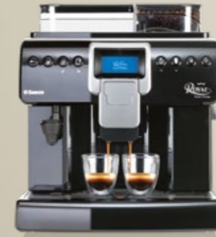
Royal Gran Crema